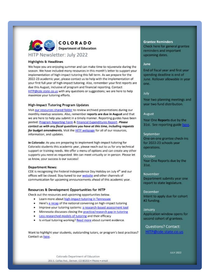
Figure G: HITP Newsletter July