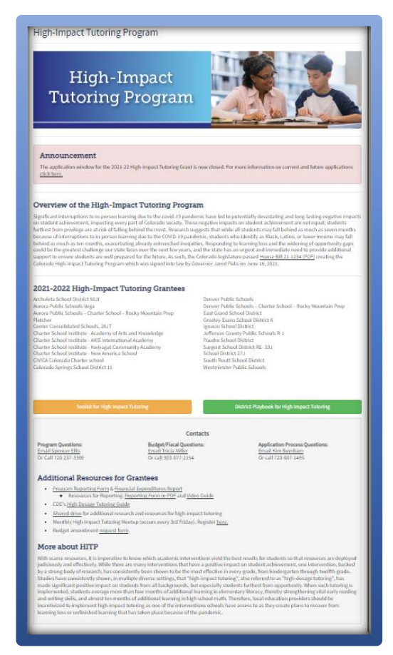
Figure F: HITP Webpage