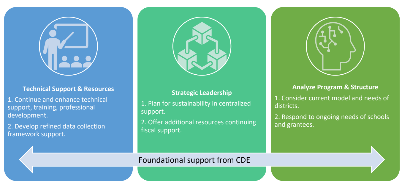
Figure H: Recommendations for HITP grant.

The below graphic summarizes the recommendations from feedback and data gathered from the grantee reports as well information documented by staff during the operationalization and implementation of the legislation. CDE staff and leadership can use this evidence to inform future decisions regarding the status of the HITP, centering these themes to provide concrete supports and conditions for future success. In sum, grantees recommend continuing and enhancing support, developing data collection framework, planning, and leading sustainability efforts, and revising the program to meet the needs of districts.