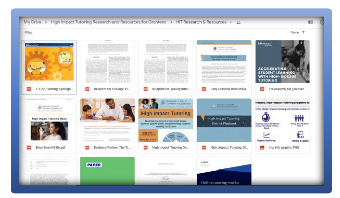
Figure C: HITP Resource Library

In addition to monthly meetups, Department staff issued a monthly newsletter for grantees to provide multiple channels of communication for the large networks of diverse participants. Monthly newsletters included updates on CDE operations, and other resources such as additional grant opportunities, relevant research/toolkits, conferences, and professional development. Staff also maintained a resources website, standing office hours, and one-on-one consultations for all grantees. Though these supports were constant and readily available, CDE staff expect growth in engagement in the coming years as the preliminary phase of implementation yielded high-quality but low-volume interactions.