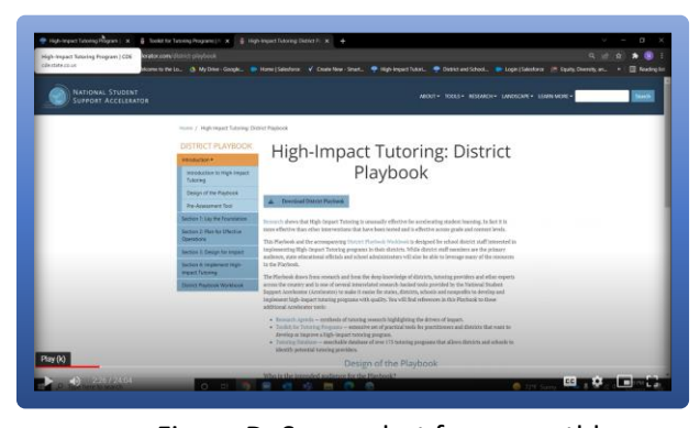
Figure D: Screenshot from monthly meetup webinar