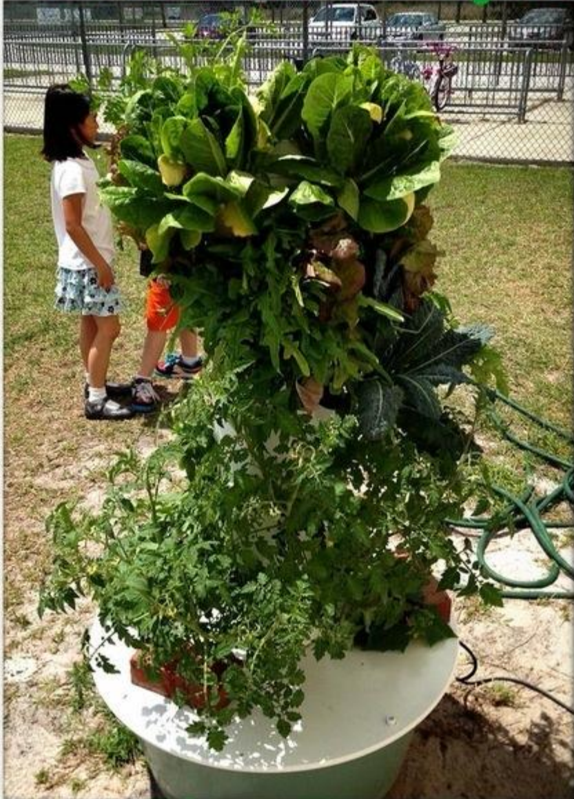
Tatum Ridge Elementary