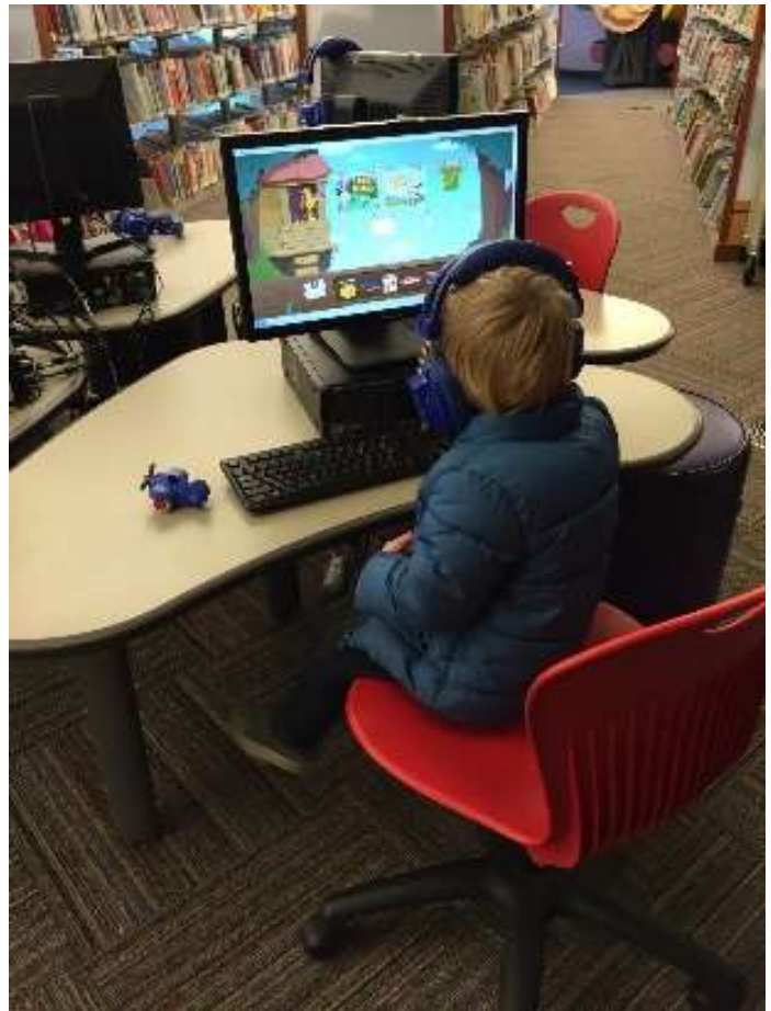
49: A child at a computer station.