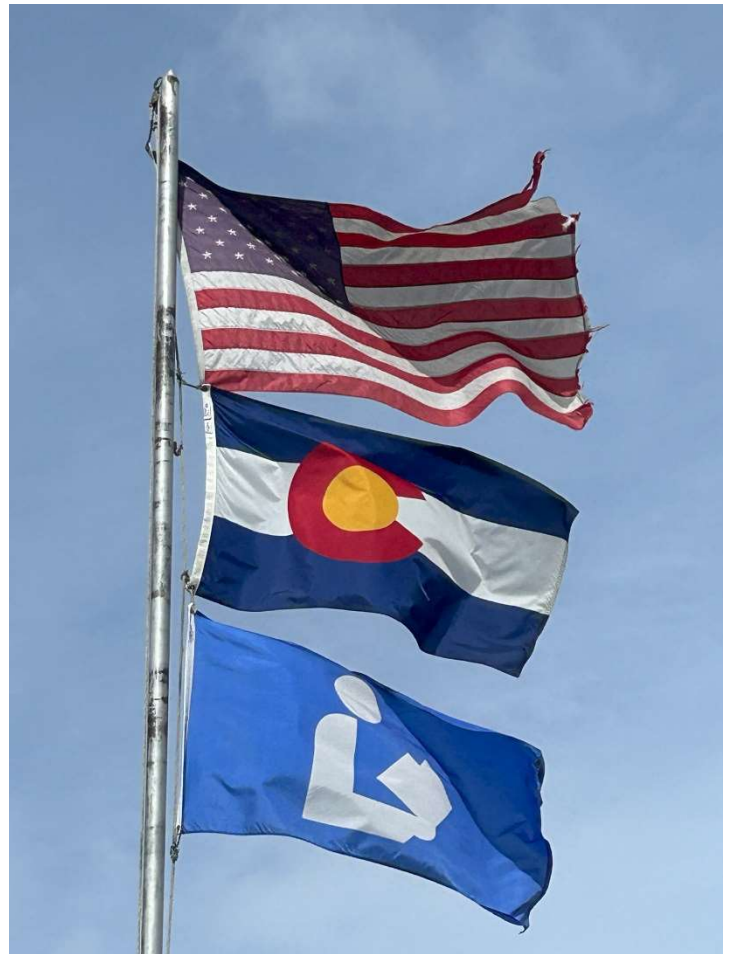
43: The flagpole at the Hayden Public Library with the American, Colorado, and national library symbol flags.

Public relations efforts build relationships with community members, leaders, and partners for positive community impact. By cultivating strategic partners, the library can expand its reach and message beyond its walls. This outreach also offers opportunities to listen to community input to find ways to improve services and meet the needs of various community members.