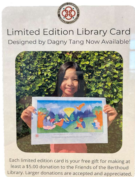
46: Limited Edition Library card at Berthoud Library District.