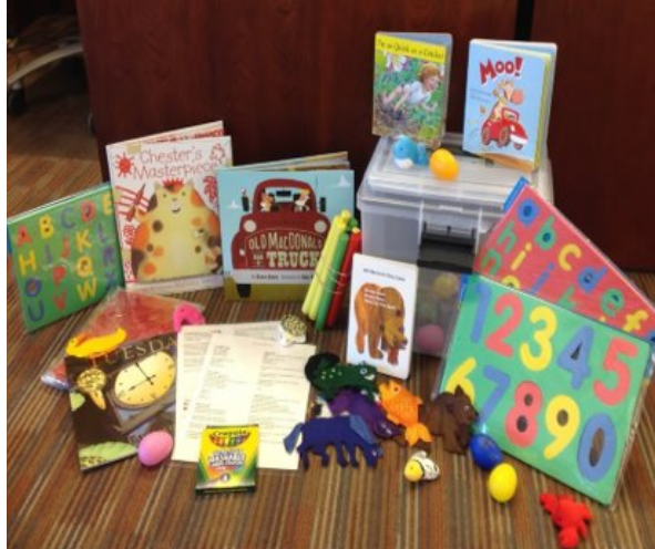
Literacy kits included a variety of books, manipulatives to increase motor skills, puzzles to develop number and letter recognition, shakers to connect with a music theme, and finger puppets to develop vocabulary, and a song list.

Each week the librarian from Ignacio Community Library District focused on one of the five early literacy practices and FFNs receive a plastic box to store all the materials. Librarians recognized their important role as early literacy teachers for FFNs as they modeled reading techniques during Story Times with young children and demonstrated activities that can enhance or build upon early literacy interactions. The information and tools provided to FFNs increased their level of comfort in using the resources at the library and at home in their role as teachers of the children in their care. “One mom took our GRT class (Five Best Practices of Early Literacy). At first, she was hesitant about the books and why we chose them. Now she's excited and tries reading at home. She's more confident with literacy and reading with kids.” (Ignacio). As one librarian noted, “What could be better than sharing the love of reading?”