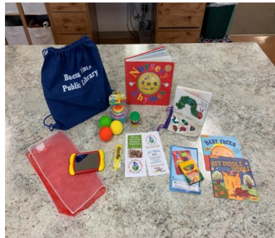
Literacy kits included a bag to store the materials, crayons, handwriting book, sorting cups of different colors and sizes, and a variety of books. (Northern Chaffee Library District/Buena Vista)

Librarians put a lot of thought into the preparation of early literacy bags or kits, and many assembled kits according to themes or adjusted for the child's age, either to be given away to FFNs or to be part of the permanent library collection. Librarians reported the flexibility of the grant was one of the parts they liked the most about GRT because it allowed them to decide whether to purchase, books, computers, or enhancing the environment based on the needs of their libraries. "We are the hot spot for little kids. We used the grant money to buy board books and leveled books. I ordered 2 shelves for the kids' room, the grant partly paid for them and our library covered the rest. It was great." (Northern Chaffee County- Buena Vista).