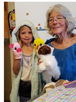
A child and her grandmother participating in a GRT event with hand puppets. (Park County)

Librarians agreed Story Times provided an opportunity for caregivers and children to be engaged in high-quality early literacy practices and created a place for FFNs to socialize and bond with each other. Story Time encourages FFN-to-FFN interactions, and the interviews yielded many examples of FFNs staying for a cup of coffee and a conversation after Story Time. One librarian said, “We've had a lot more library attendance. A lot of the families are realizing it's not only a great resource for literacy, but a safe place to play and socialize. A