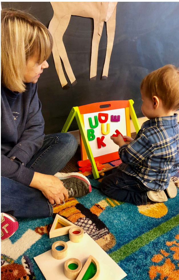
Playing with letter-shaped magnets reinforces the idea that letters have sounds and can form words.

Several GRT libraries also noted that the culture of their organizations changed to be more family friendly encouraging play and the noise that comes with it. One librarian (Pines and Plains, Elbert county) described a particularly well-received craft activity stating, "I did a sensory activity for one of my story times in January- we made snow dough. The kids absolutely loved it. We had "snow" all over the place. I had to get the big "Ghostbusters" style vacuum cleaner out to clean up the mess.... The parents and FFNs were quite happy that we made the mess at the library and they didn't have to deal with it at home. We also got out a lot of the manipulative that we ordered last year in Kiowa. Up until now, we really didn't have a lot of space for them. We've opened up some bottom shelves to store them. The kids had so much fun! They lined the aisles with magnetic letters, numbers and puzzles. No one wanted to go home after story time."