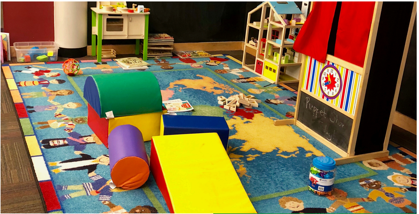
Playful and interactive spaces encourage longer visits to the library.