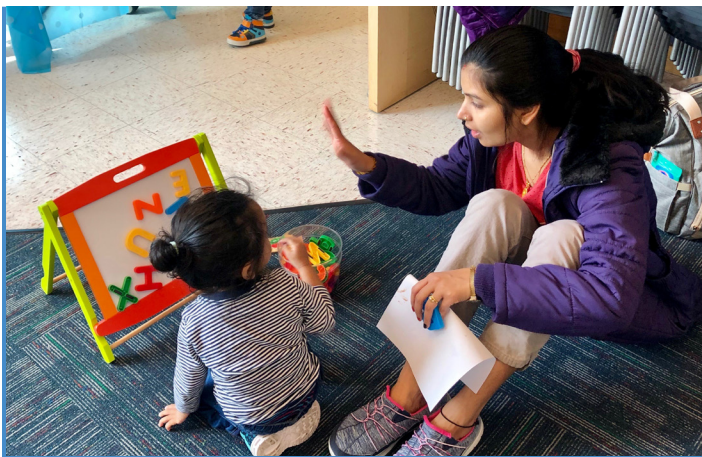
Providing opportunities for children to explore and lead their own learning is a great way to support literacy development.

- Take services outside of the library to places FFN naturally go. FFN providers may not be regular library users for a variety of reasons such as transportation issues, time, or convenience of the library location. According to a librarian (Canon City), “The best strategy was going out to the places that they were at originally.... The farmer’s market was one of our better outreach programs that we did.... The farmers market has become a gathering spot for many of our FFN providers. We have been doing story times at the farmers market for the last 4 weeks and the attendance has grown over that time. Many of the FFN providers and parents have been using this time to discuss events that are coming up and sharing resources.” Another librarian (Pikes Peak, Colorado Springs) listed and reflected on outreach events, “...playgroups started by Alliance for kids, visiting playgroups run by Catholic Charities, and at summer food giveaways arranged by the local school district and Care and Share. These outreach opportunities shed a lot of light on where the library can connect with families.” Other locations frequently used by GRT libraries include parks, malls, and community centers. As GRT libraries discovered, taking services and programs off-site will increase the likelihood of attendance and reach additional audiences who may not frequent the library.