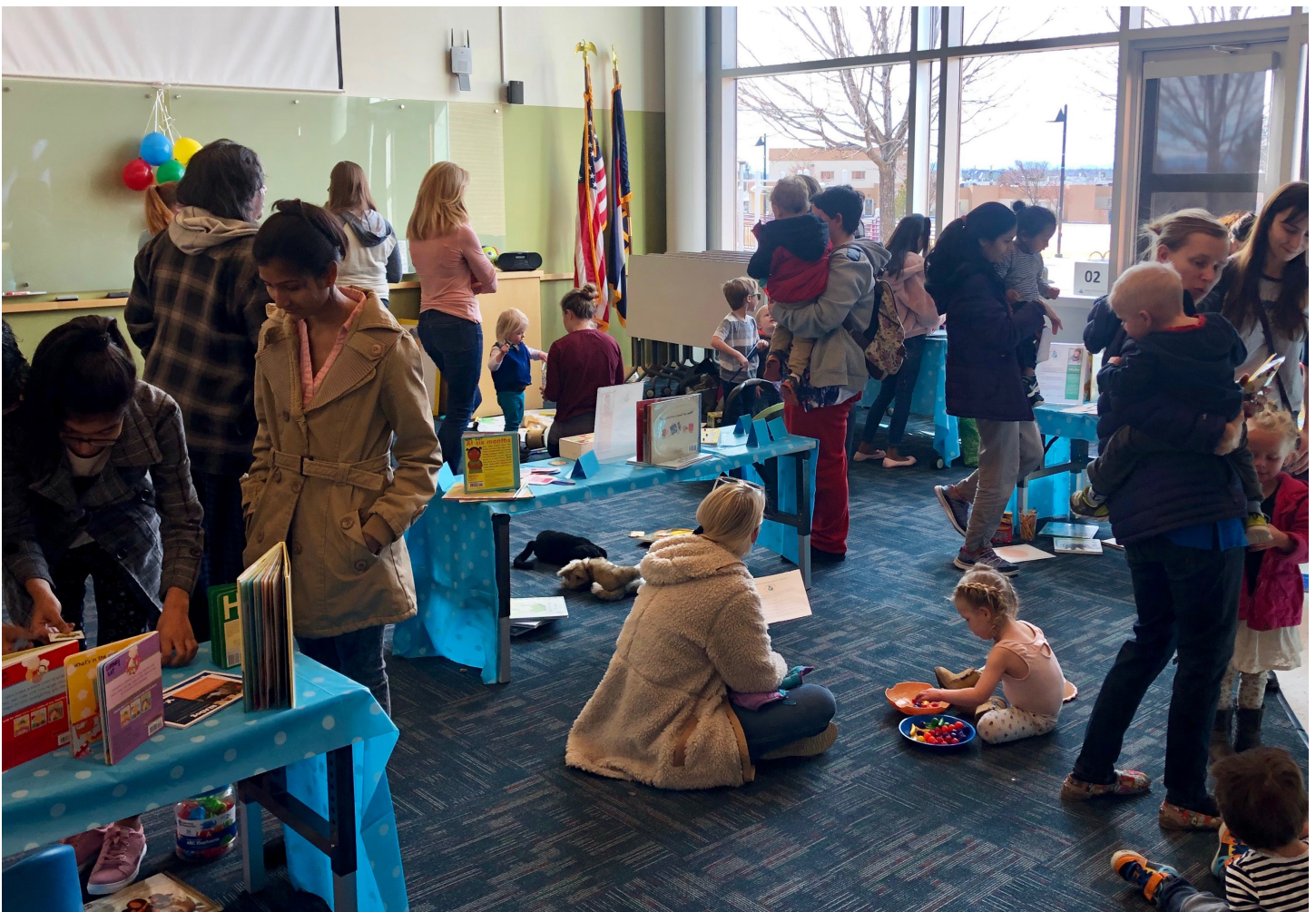
Special events for FFN can include the children in their care while building community among caregivers.

GRT libraries demonstrated that outreach and partnerships were critical in developing relationships with FFN caregivers. Through consistent efforts, libraries were able to reach new audiences and promote the adoption of early literacy practices. Libraries were able to build relationships with FFN caregivers by providing welcoming spaces, connecting caregivers to resources and services to improve their quality of care, and fostering a sense of community among providers and library staff.