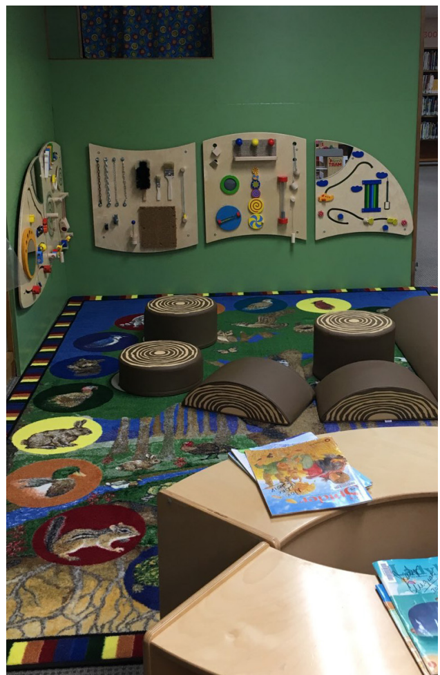
Interactive boards help develop fine motor skills used in writing.