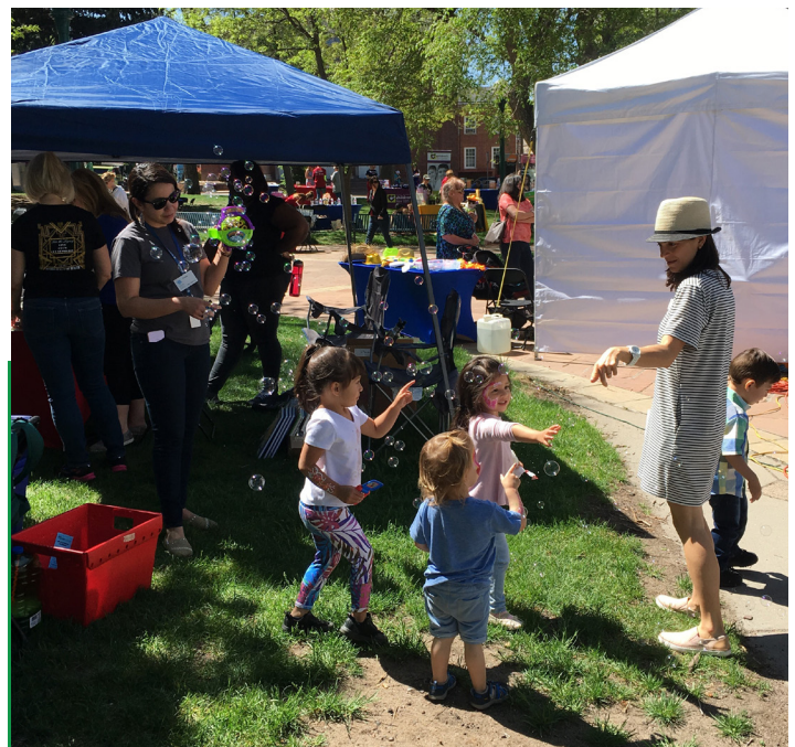
Growing Readers Together at the first annual "Strolling Thunder" event, Colorado State Capitol, July 2019