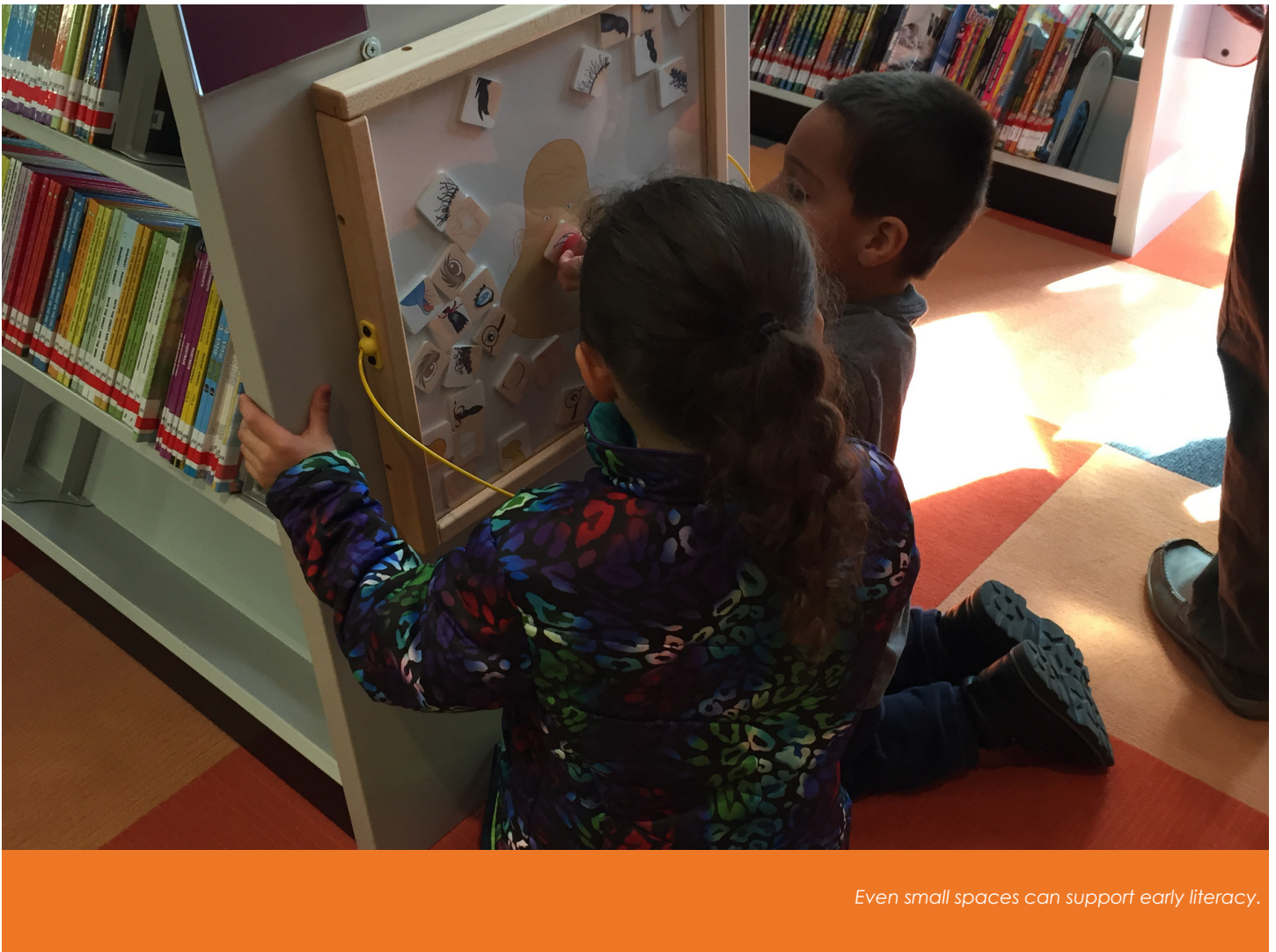
Even small spaces can support early literacy.

three years of the grant and provided further insights into program implementation along with capturing participants experiences and sentiments towards the program. Finally, discussions during virtual meetings hosted by the Colorado State Library with participating libraries were also evaluated. These meetings provided an opportunity for librarians to discuss their local practices, ask questions of other participants and develop relationships among themselves. Virtual meetings and interview transcripts were analyzed for patterns and common themes expressed by participating libraries using Maxqda software.