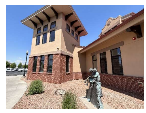
24: Alamosa Public Library.