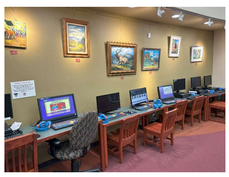
29: Ignacio Community Library computer area and public art.

prevention, regular system security updates, and commercial antivirus/anti-malware software packages.