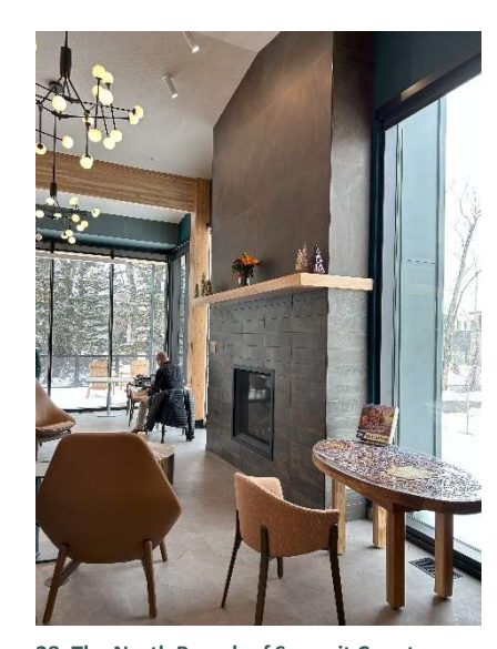
28: The North Branch of Summit County Libraries, Silverthorne.