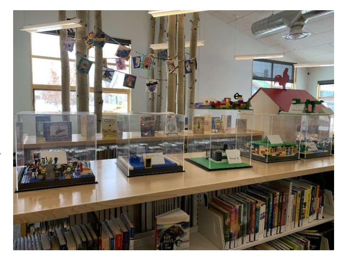
32: Ridgway Library District Kids' Lego Projects on Display.

□ Provide spaces for local artists and exhibitors, including protocols for liability agreements in case something is damaged or stolen.