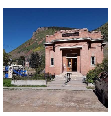
27: Silverton Public Library.