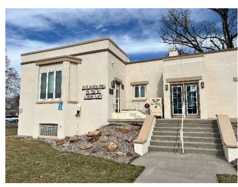
25: Julesburg Public Library.