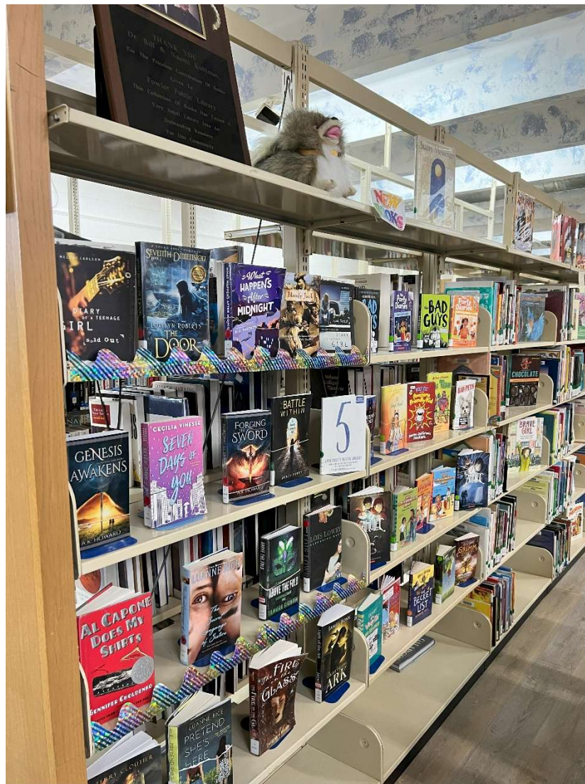
21: New books featured at the Fowler Public Library.