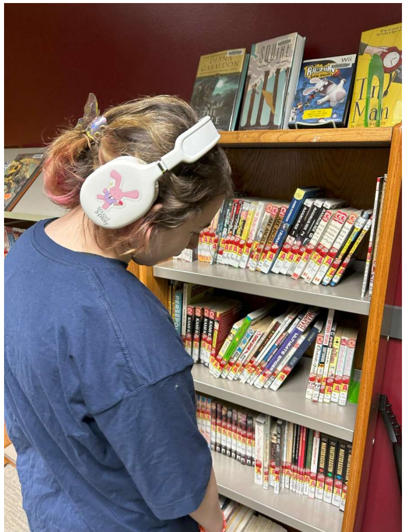
13: A teen browsing the graphic novel collection in the Lamar Public Library Teen Space.