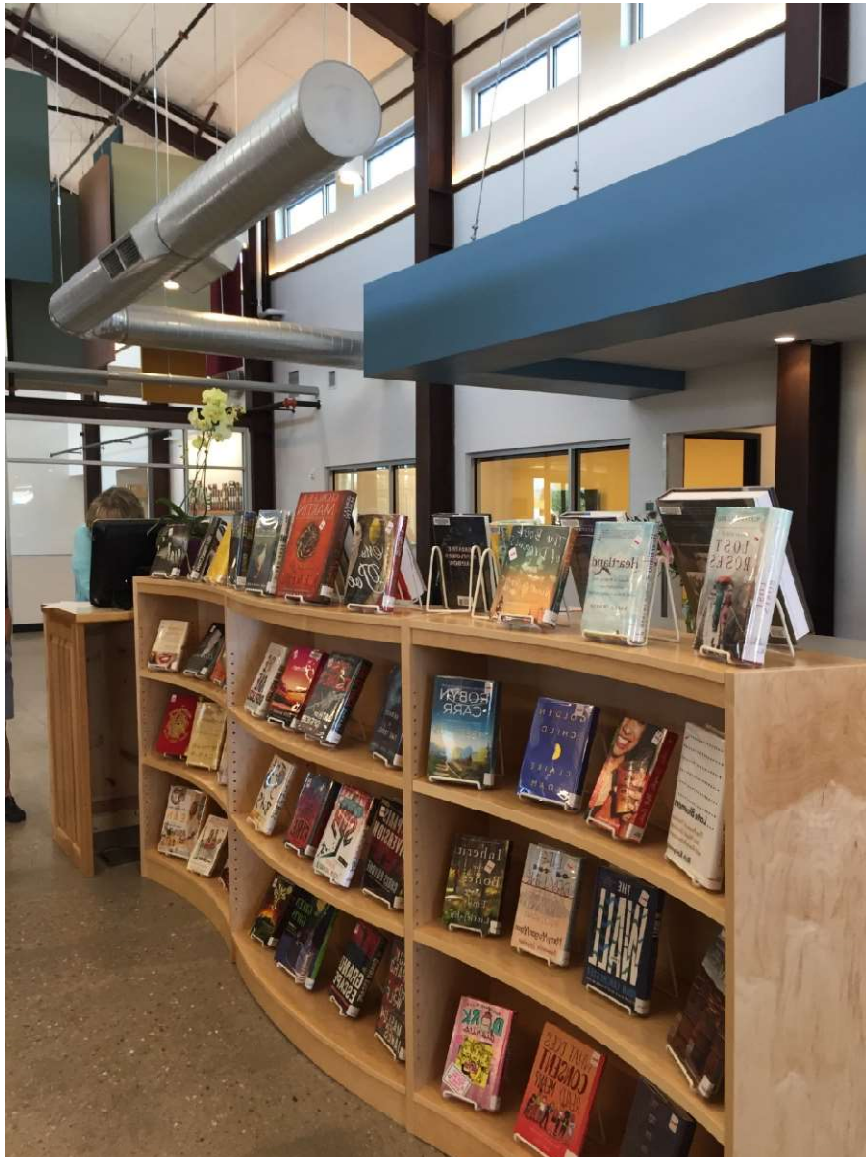
14: Lone Cone Library District book display.