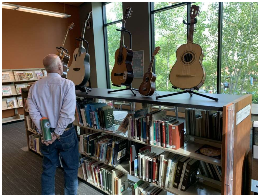
10: Glenwood Springs Branch of the Garfield County Public Library District guitar check out program.

When public libraries participate in regional and/or statewide resource sharing, the community gains expanded access to physical and digital materials. All libraries benefit, for example, from being members of the Colorado Library Consortium, to participate in courier service, benefit from discounts on library materials, and increase effectiveness through collaboration. Libraries may also expand access to rare, local collections by digitizing collections and making them available through the Colorado Virtual Library and its partner systems.