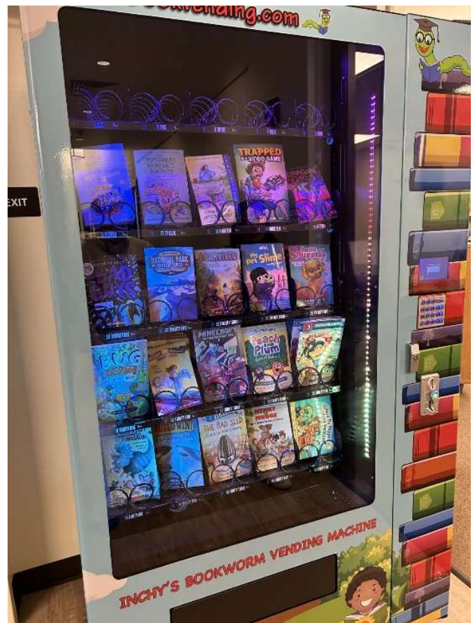
12: Book Vending Machine at Salida Regional Library.